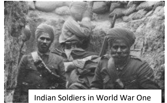
Indian Soldiers in World War One

In this year's Remembrance Day assembly on November 10th, 2023, Villiers High School came together as a community to pay our respects and honour the brave soldiers who have served during times of conflict. While we always remember the sacrifices of the many individuals who fought in conflicts since WWI, this year, we took a moment to reflect on the often-overlooked contributions of Indian and Black soldiers. These courageous individuals played a crucial role in the conflicts, and it is imperative that their stories and sacrifices are also remembered and acknowledged.